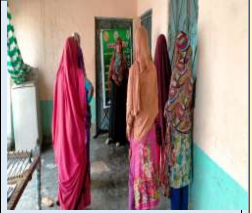
COVID-19 Awareness sessions at Khairpur District