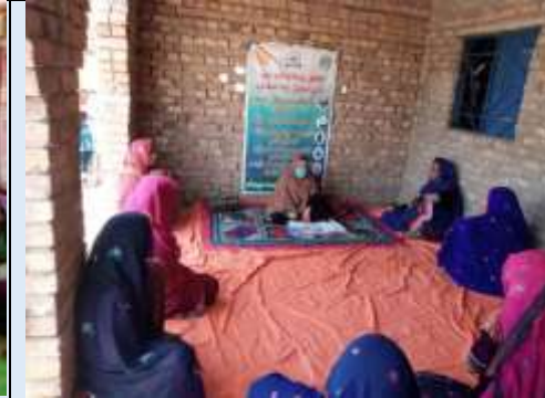
COVID_19 Sessions at District Mirpurkhas