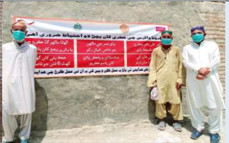
COVID_19 IEC Material distribution and Displayed at District Jacobabad under HelpAge International Project