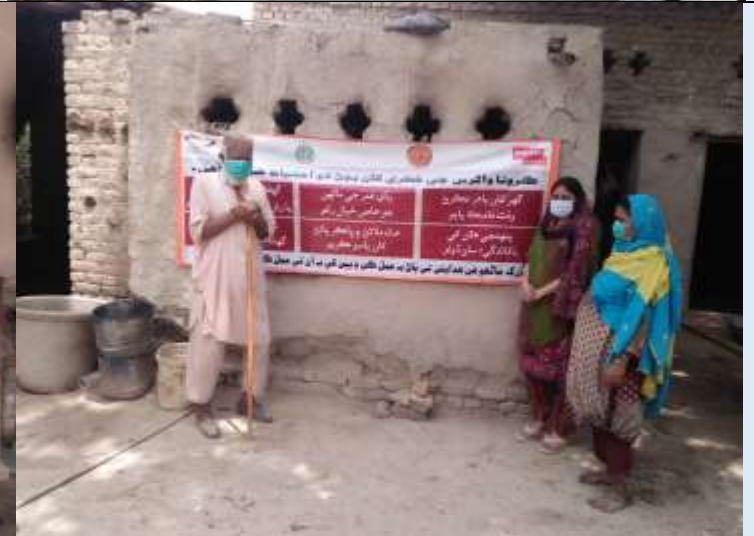
COVID_19 IEC Material distribution and Displaud at District Shikarpur under HelpAge International Project